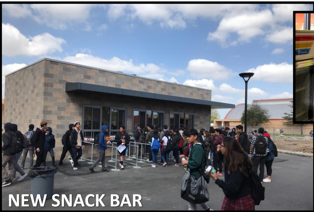
NEW SNACK BAR

Schedule Status: Science Center Underway