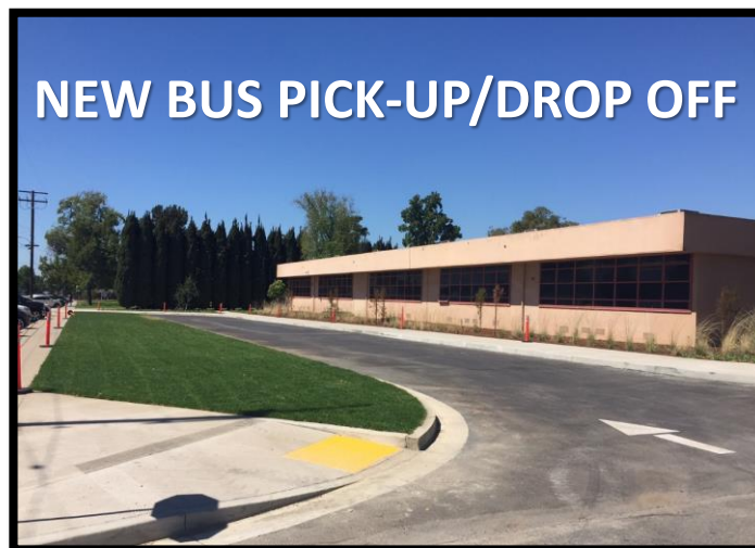
NEW BUS PICK-UP/DROP OFF