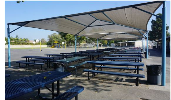
Lunch shelter due for an update.