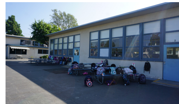
Typical seating outside of classrooms.