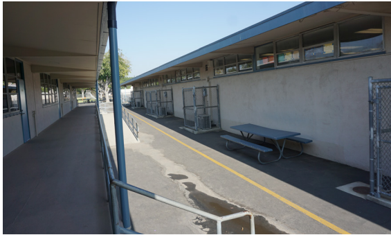
Puddling and drainage issues around campus.