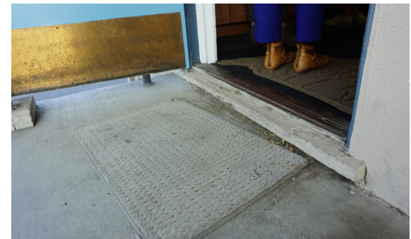
Uneven, cracked threshold into classroom.