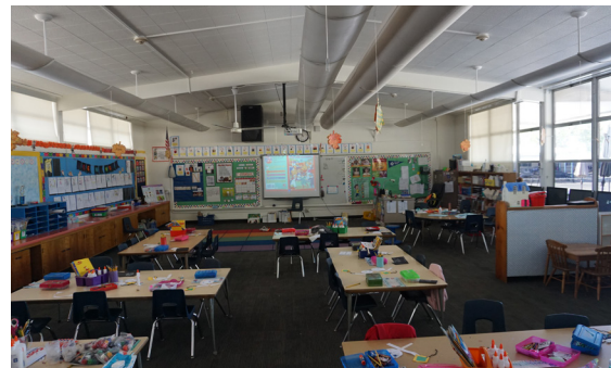
Typical kindergarten classroom.