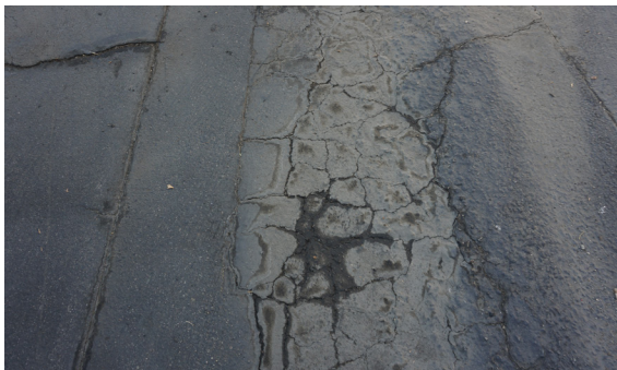
Cracked, damaged hardcourt paving.