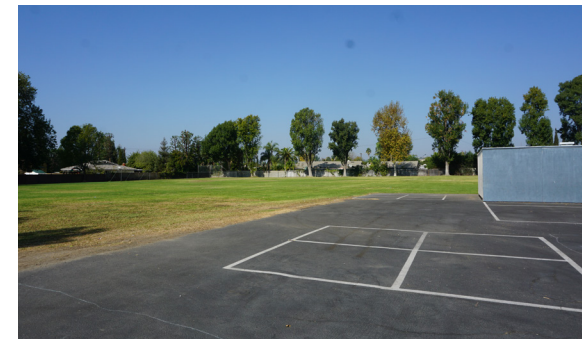
Hardcourts and playfield.