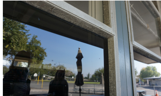
Window threshold in need of attention.