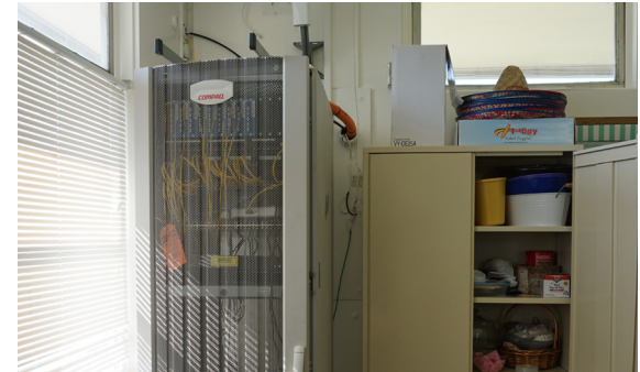
In need of proper IDF storage.