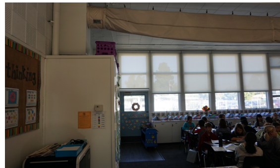
Classroom equipment in need of an update.