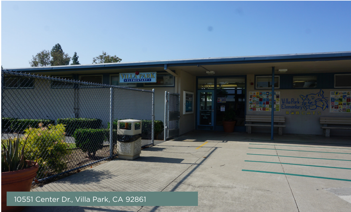
10551 Center Dr., Villa Park, CA 92861