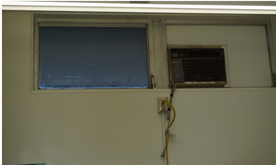
Classroom exterior in need of an update.