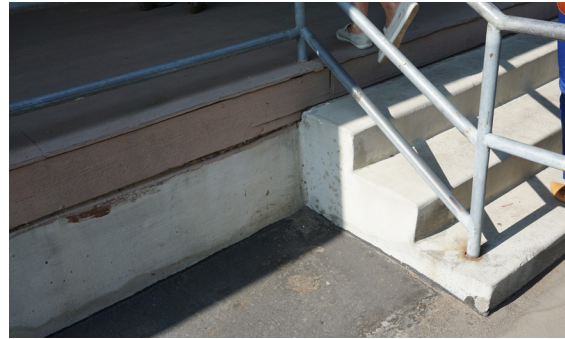
Accessibility to classrooms in need of attention.