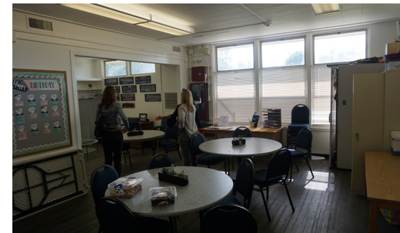
Faculty eating area.