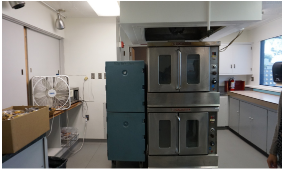
Food warming kitchens.