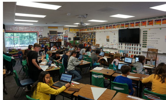
Upper grade classroom.