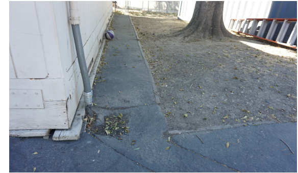
Drainage issues near portables and planters.