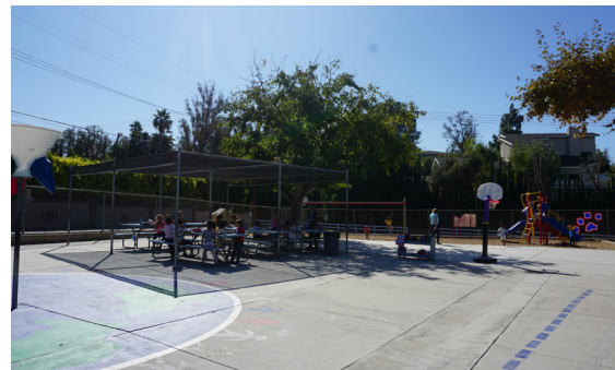
Kinder lunch area.