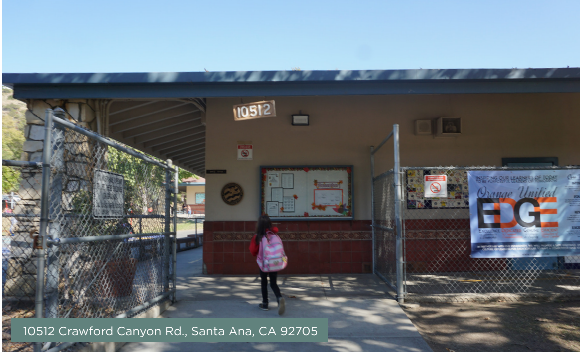
10512 Crawford Canyon Rd., Santa Ana, CA 92705