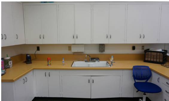
Faculty lounge casework due for an update.