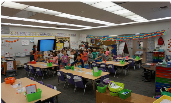
Typical kindergarten classroom.