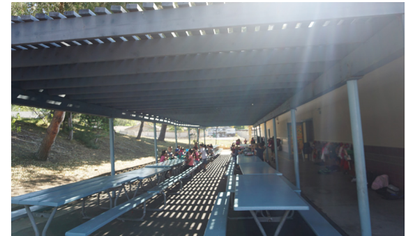
Wood-slat lunch shelter.