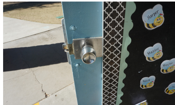
Door hardware due for an update.