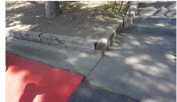
Planter beds in need of attention.