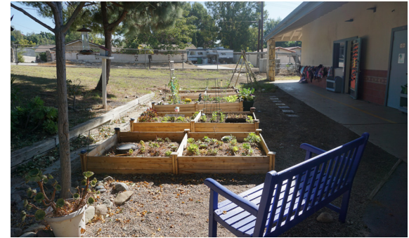
Planter boxes for outdoor learning.