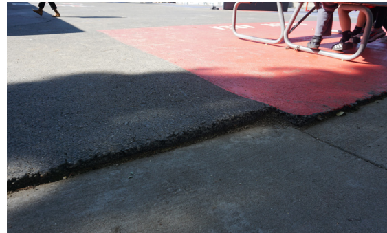
Lifting under play structure.