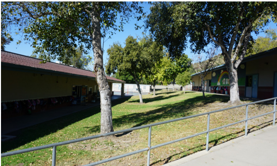
Typical area between classrooms.