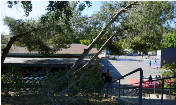
Dense tree line causing safety hazard.