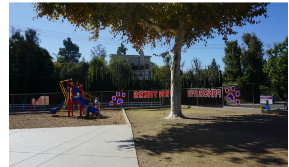
Kinder play area.