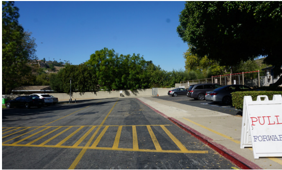
Pick up-drop off area.