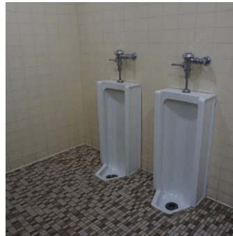
Typical restroom condition.