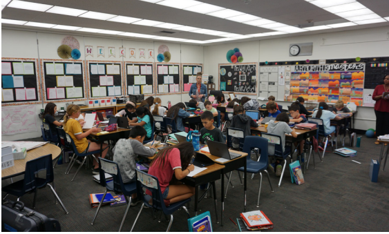
Lower grade classroom.