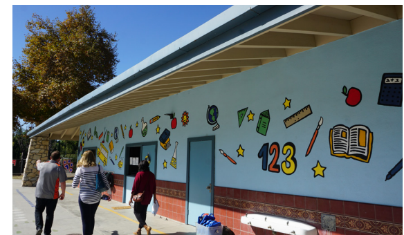
Murals found around campus.