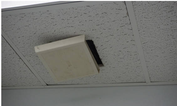
Classroom technology due for an update.