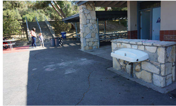
Typical water fountains due for an update.