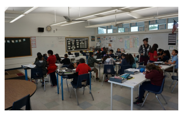
Typical upper grade classroom.