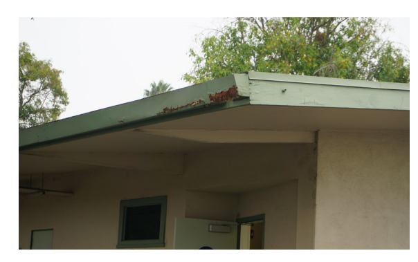
Damaged fascia boards.