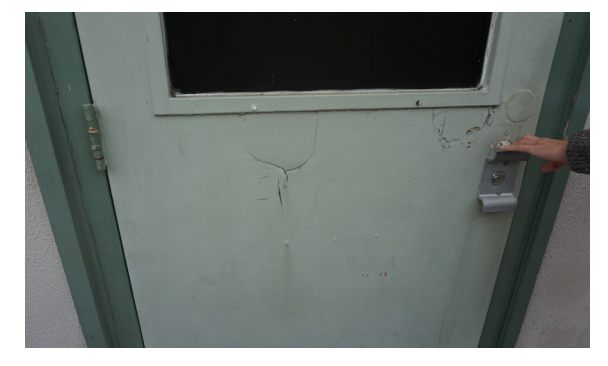
Damaged door condition and hardware in need of an update.