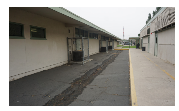
Flooding in between classroom buildings.