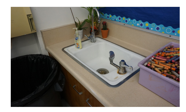
Classroom fixtures in need of an update.