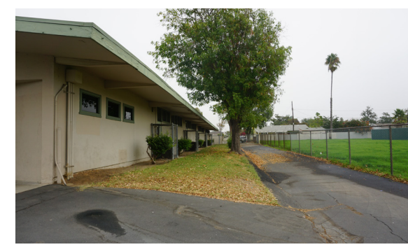
Sloping issues near playfields.