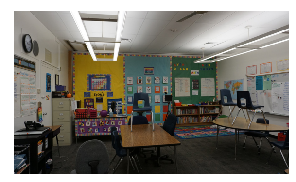
Typical lower grade classroom.