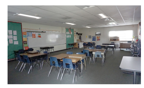
Typical portable classroom.