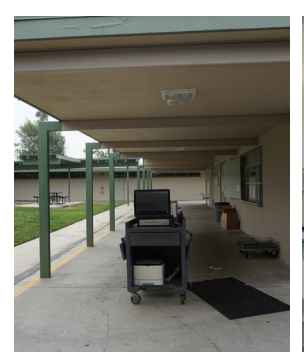
Kitchen and food serving.