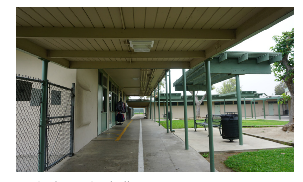
Typical exterior hallway.