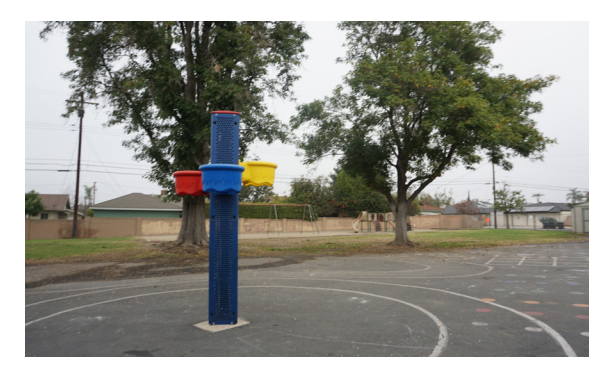
Kinder play area.