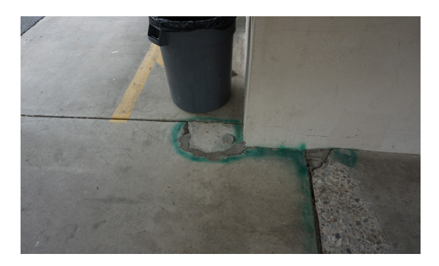
Lifting concrete pads around campus.