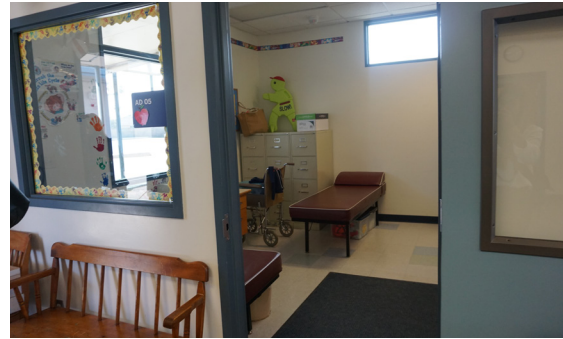
Nurse's office and cot room.