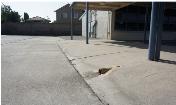
Drainage onto playground causing flooding.