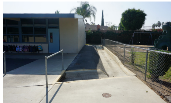
Ramping issues around campus.