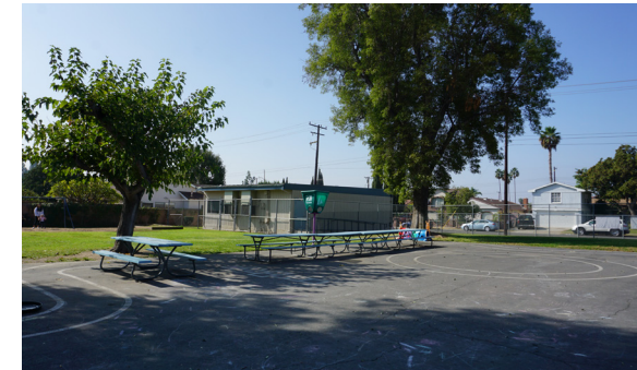
Kinder play area.