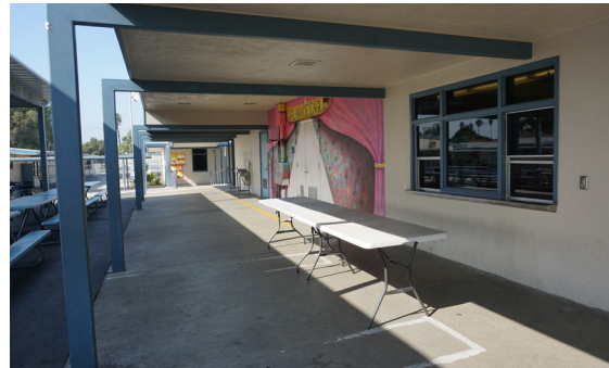
Lunch serving area.