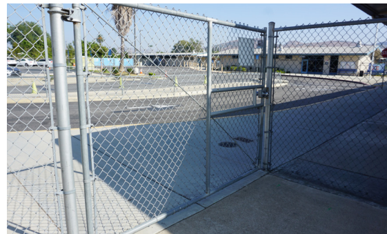
Typical fencing condition around campus.