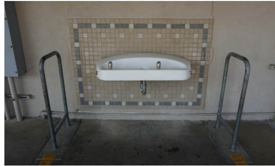
Typical water fountains in need of an update.