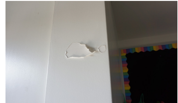
Classroom paint needs updating.