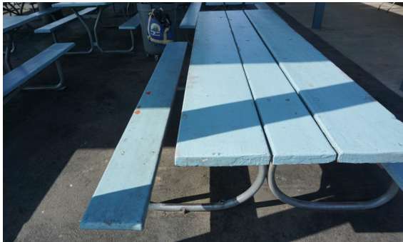
Typical lunch shelter furniture needs updating.