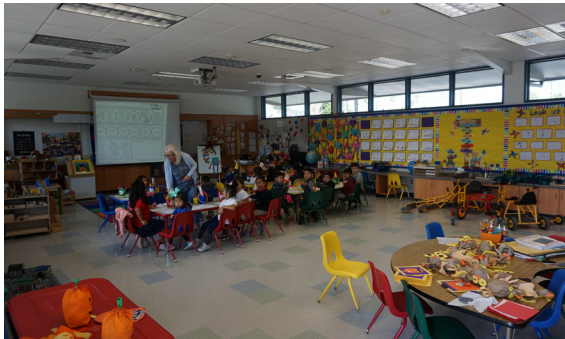
Typical kindergarten classrooms.