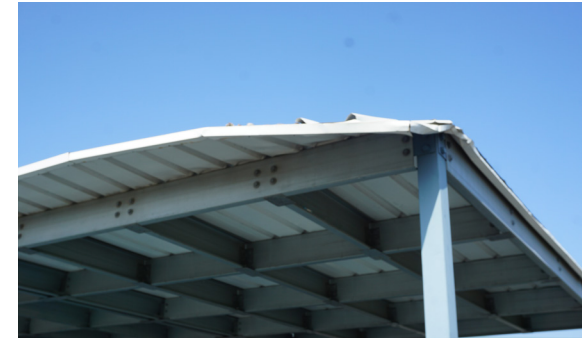
Damaged lunch shelter needs attention.