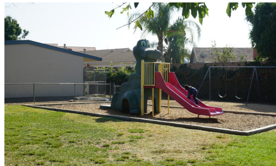
Kindergarten play structure.