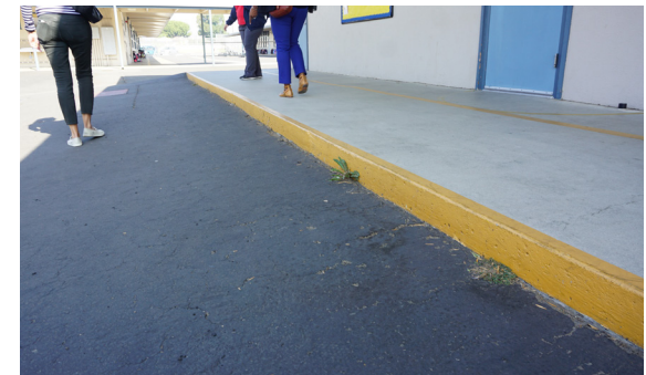
Steep curbs around campus.