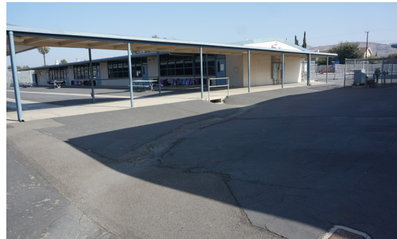
Flooding issues around campus.