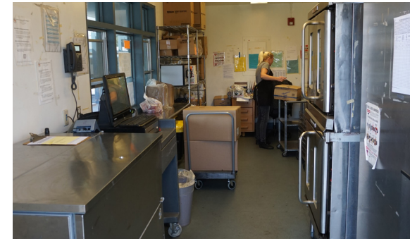
Food warming kitchen.