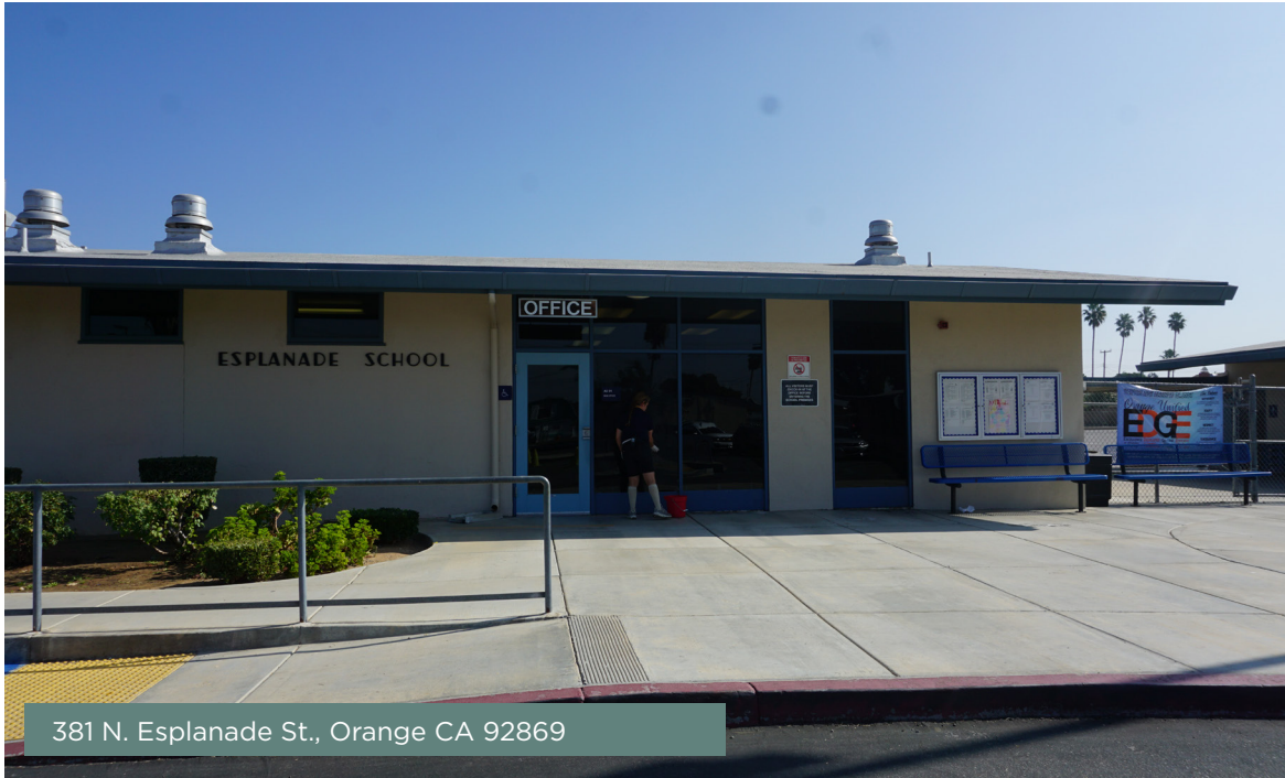
381 N. Esplanade St., Orange CA 92869