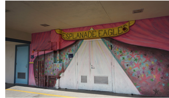
Area for school performances/awards.