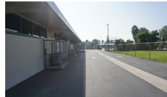
Fire lane access.