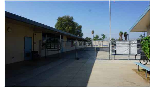
Typical outdoor area between buildings.