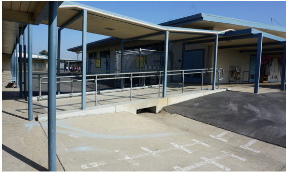
Drainage issues on campus.