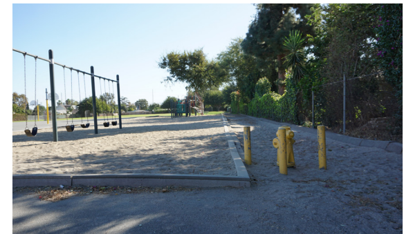
Sand pit causing maintenance and safety issues.