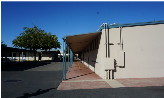
Typical exterior walkway.