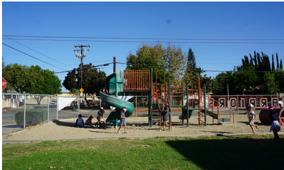
Kindergarten play area.