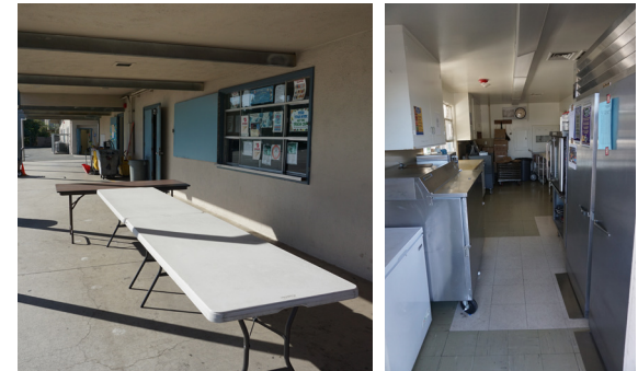
Kitchen and food serving.