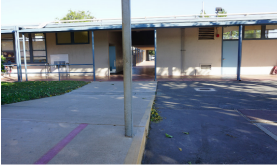
Sloping issues around campus.