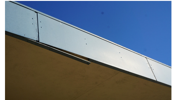
Damaged fascia boards in need of attention.