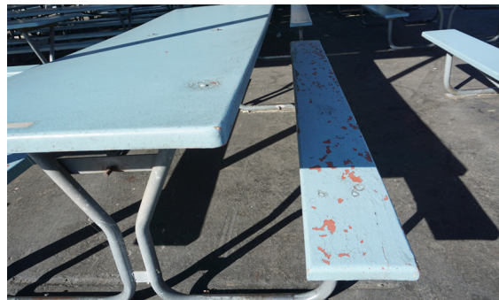
Lunch shelter furniture due for an update.