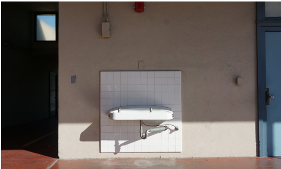
Water fountains due for an update.