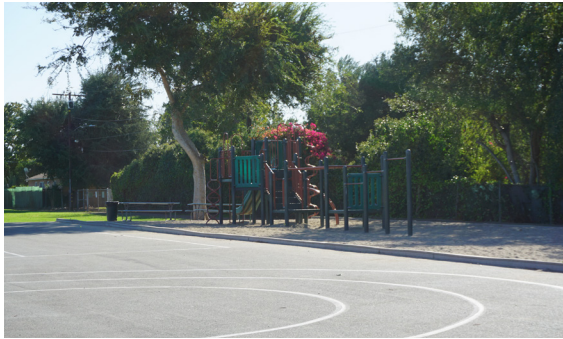
Hardcourts and play structure.