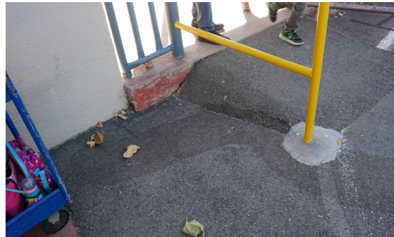
Access issue into kindergarten area.