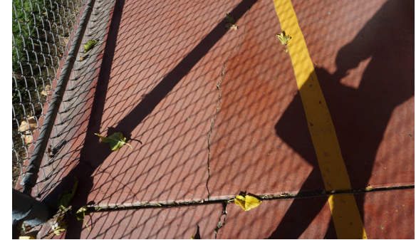
Lifting concrete pads - tripping hazards.