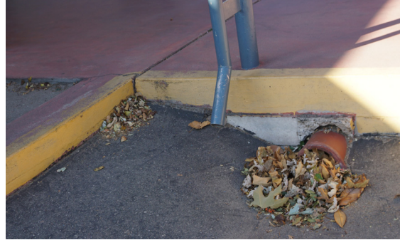
Drainage issues causing flooding.