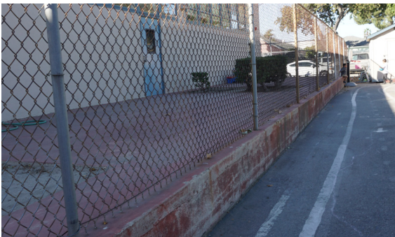
Aged curb need repainting.