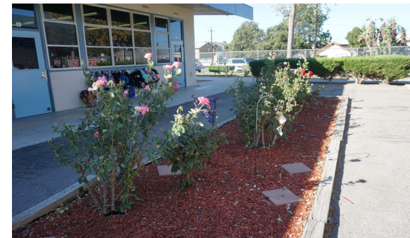
Typical outdoor space between classrooms.