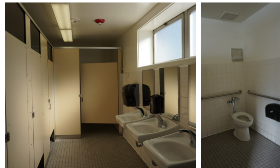
Typical restroom condition.