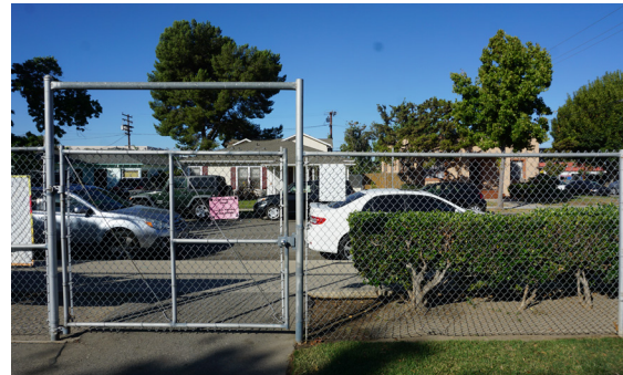
Typical fencing condition.