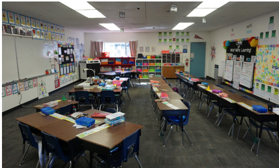
Typical portable classroom.