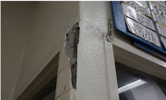
Locker room interior in need of attention.