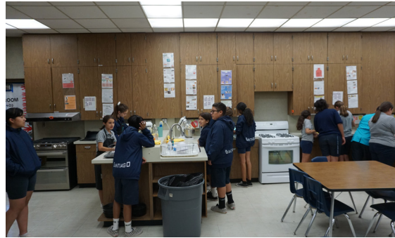
Home economics room.