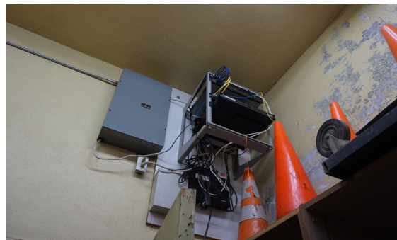
In need of proper IDF storage.