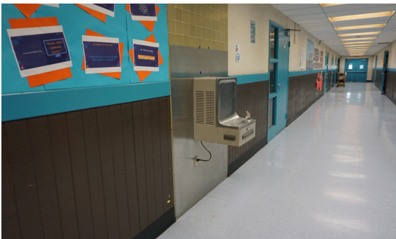
Typical water fountains due for an update.