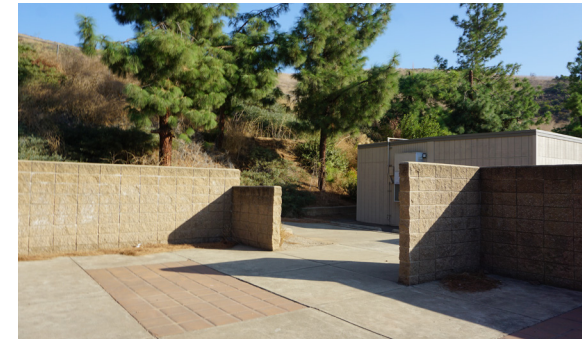
In need of outdoor learning spaces.