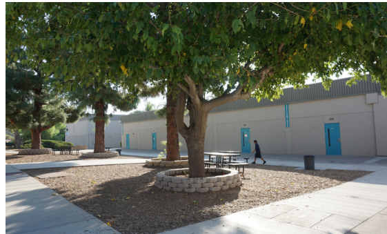
Typical planting area.