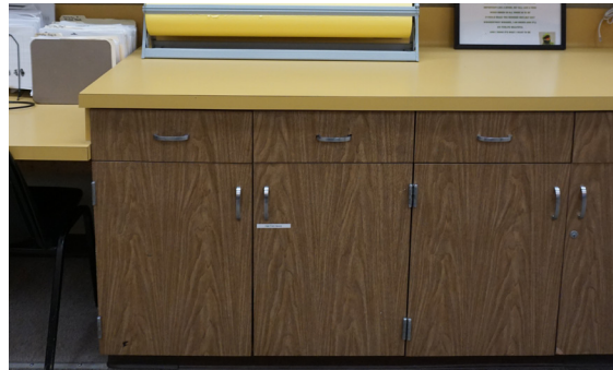
Classroom casework due for an update.