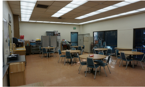
Faculty lunch room.