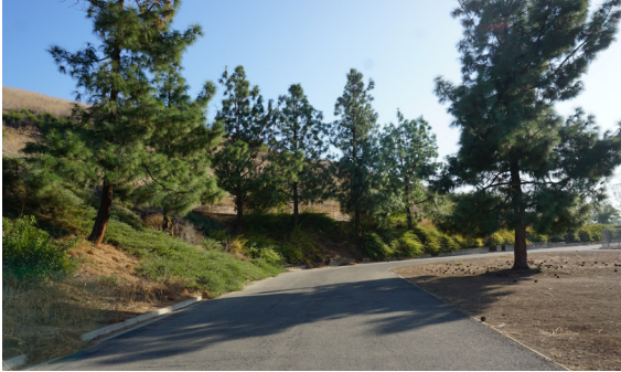
Dense tree line causing safety hazard.