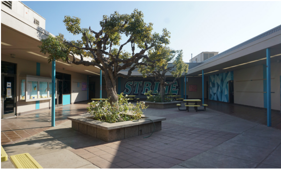
Central atrium area.