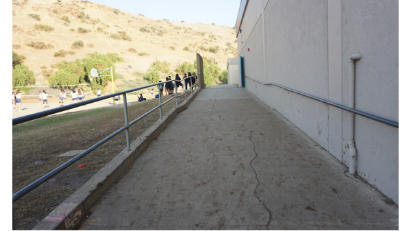
Access/ramp concern to locker room.