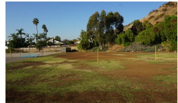
Playfields in need of attention.