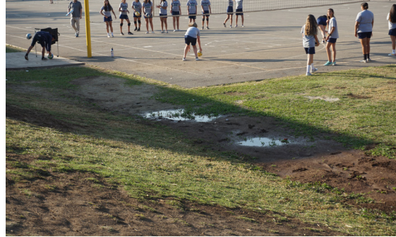
Flooding issue on playfields.