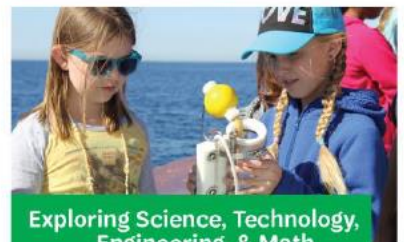
Exploring Science, Technology, Engineering, & Math