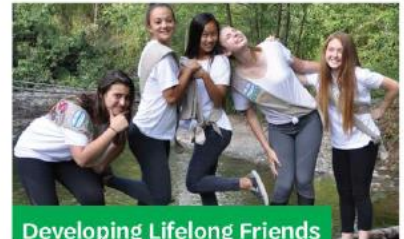
Developing Lifelong Friends

Girl Scouts of Orange County offers programs for Girls in K-12th Grade.