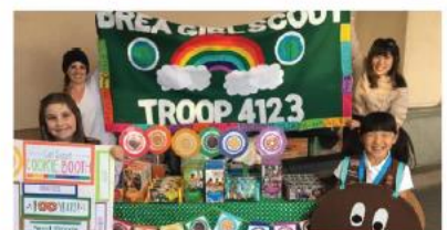
Learning Financial Literacy Skills